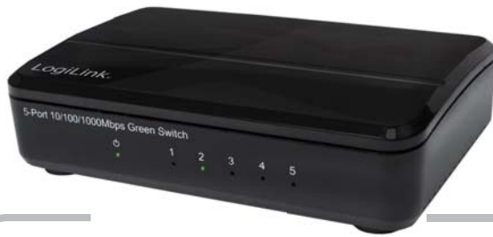
Art No. NS0105