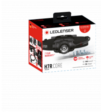
Exemplary Packaging Illustration