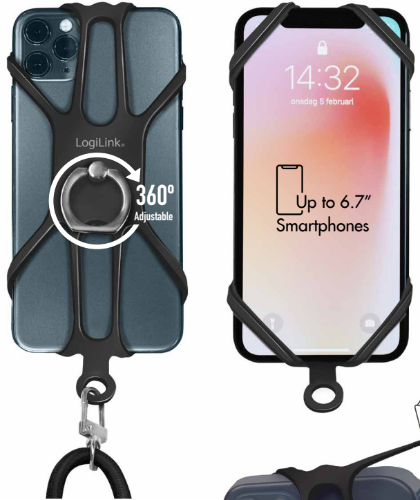
Durable & Flexible Silicone

Made with premium elastic silicone, easily put it on and take it off without damaging or scratching your smartphone. The 360° adjustable finger ring can be used as a phone stand for watching videos, taking photos and much more.