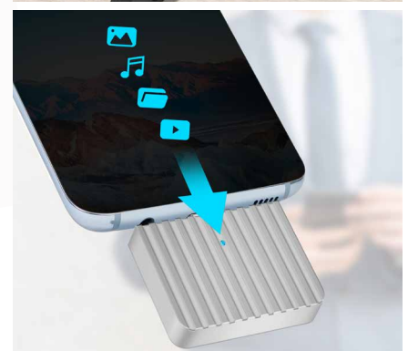
Easy backup/read files to SSD