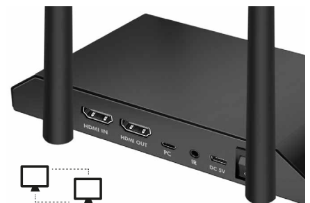
Monitor on both local and output displays