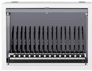
USB-C Charging Station with Cabinet (SCS0104)